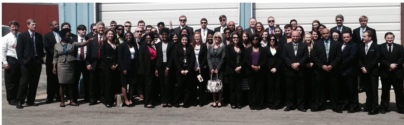
The 2015 John A. Gupton Marketing class, pictured here at the Wilbert Vault plant in Nashville, TN.