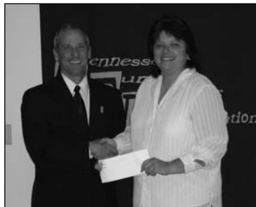
DONNET BULLARD TFDA MEMORIAL FUND SCHOLARSHIP